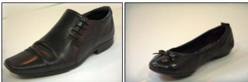
(Examples of acceptable shoes.)

Shoes: black, traditional, formal style in leather or leather type only. Trainers are not permitted. Boots with large buckles/metal studs are not permitted.